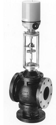
VG2000 Series Valves with VA-3100 Series Non-Spring-Return Electric Valve Actuators