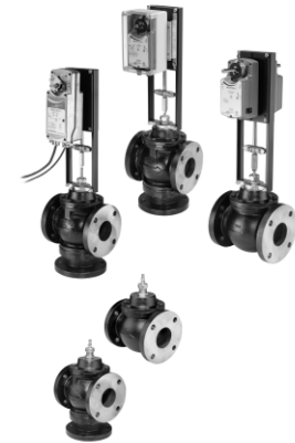
VG2000 Series Electric Cast Iron Flanged Globe Valves