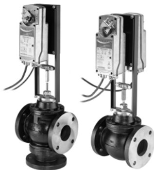
VG2000 Series Valves with M9220 Series Non-Spring-Return Electric Valve Actuators